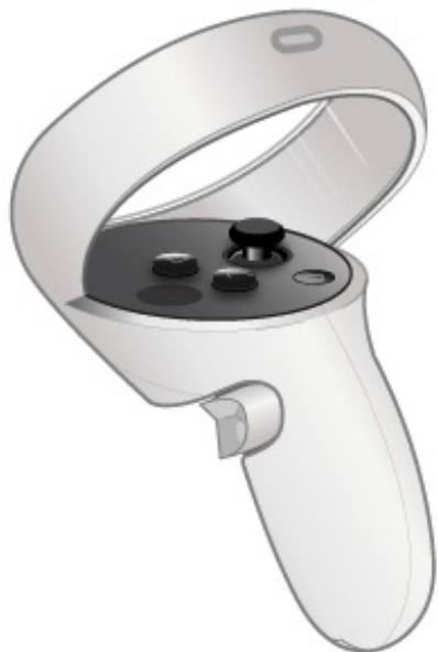
Figure 3. VR controller buttons