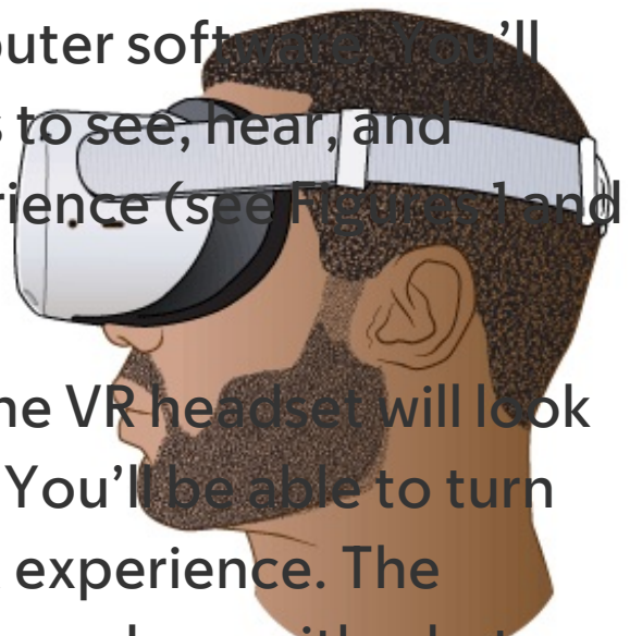
Figure 1. Wearing a VR

The controllers have buttons that let you touch, pick up, and