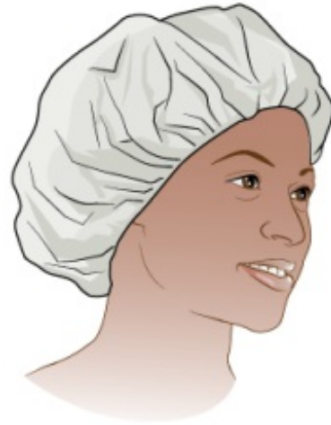
Figure 5. A disposable hair bonnet