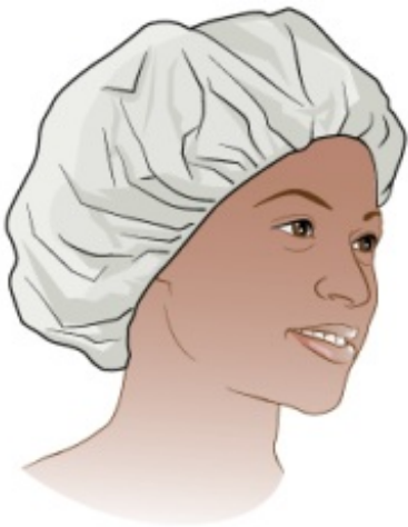
Figure 5. A disposable hair bonnet