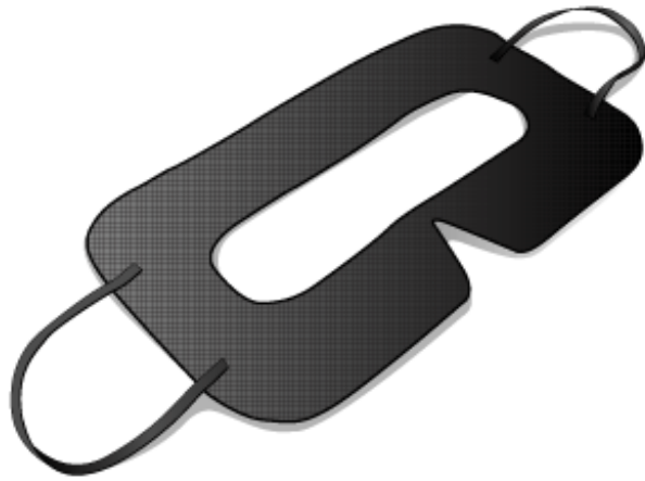
Figure 4. A disposable eye mask