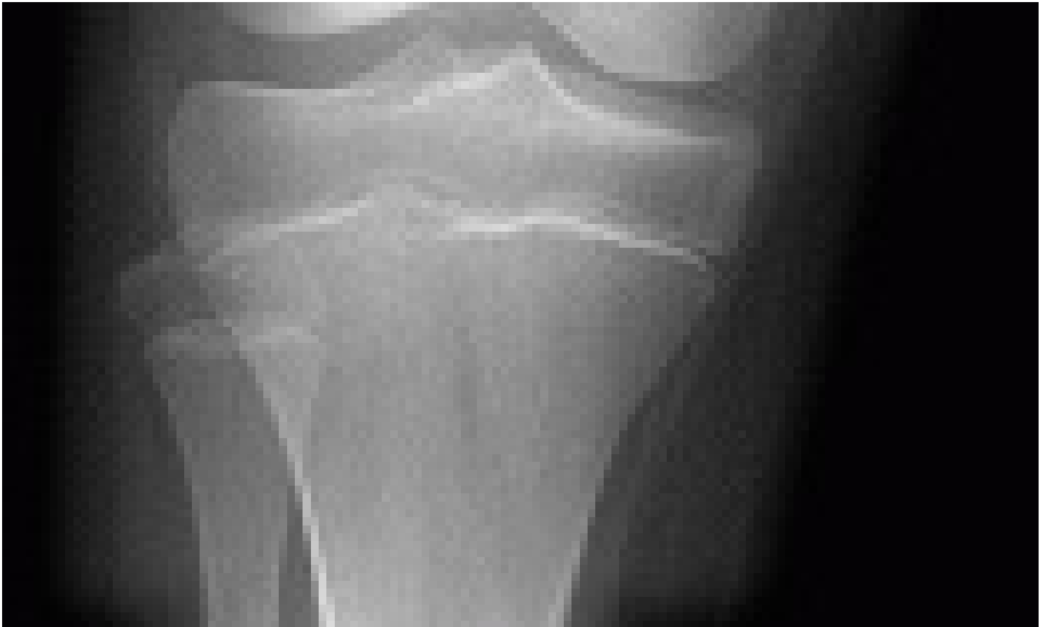
This is an x-ray of the thigh just above the knee showing an osteosarcoma. The arrow points to the whiter region, which is the tumor.

Call 212-639-6219 Monday through Friday, 8:30 a.m. to 5:30 p.m., (Eastern time)