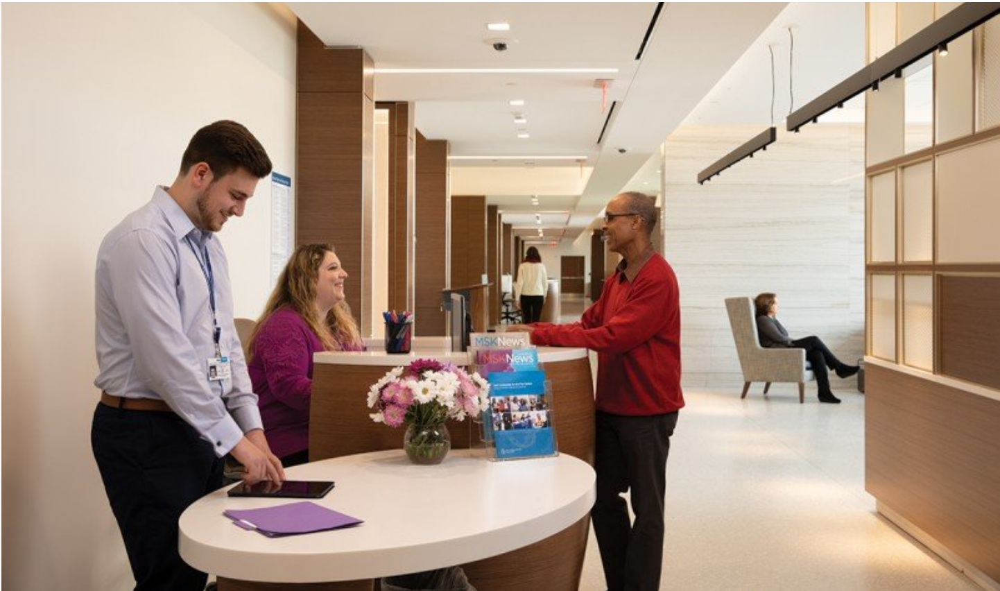
The staff at MSK Nassau offer compassionate, expert care that treats each person as an individual.