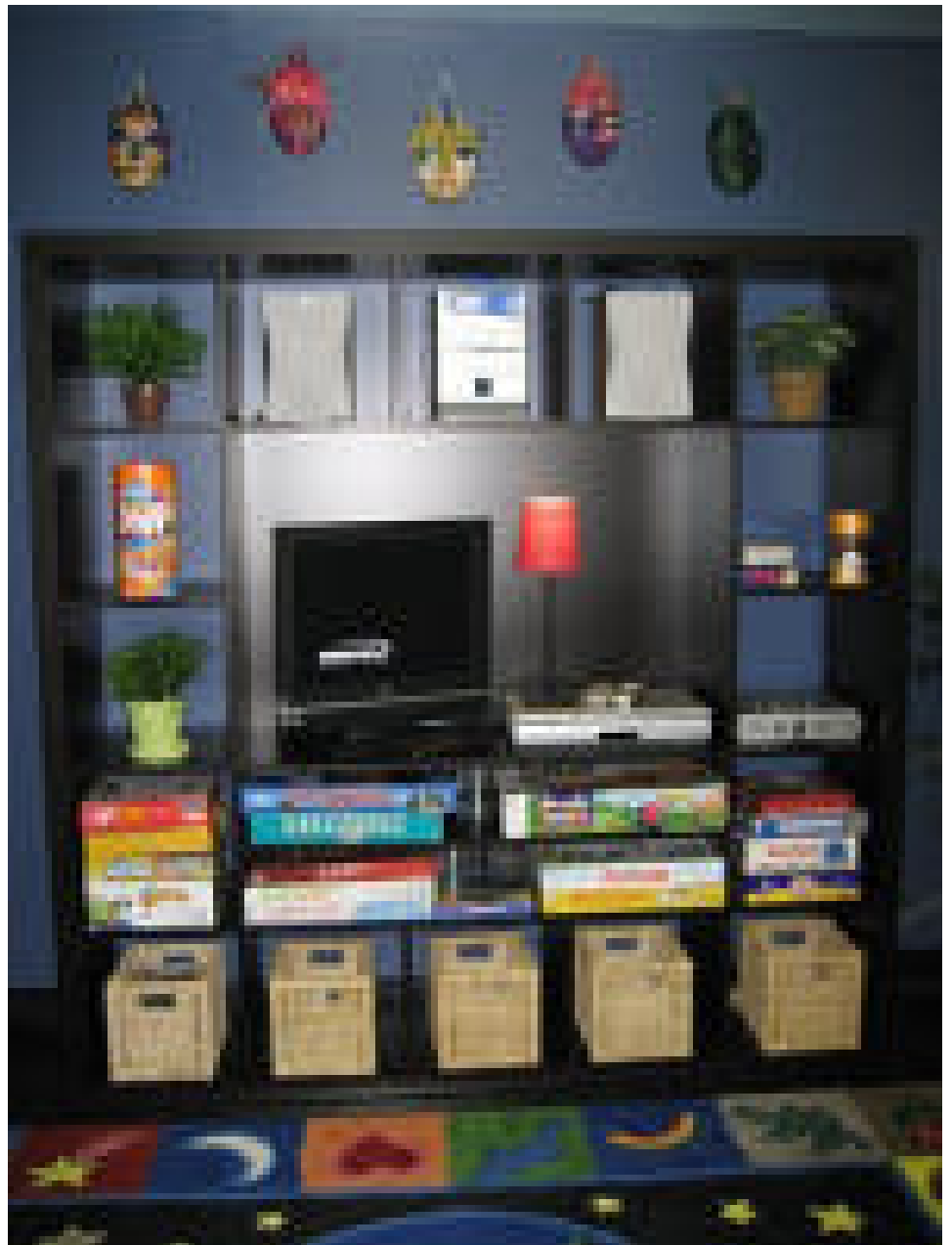
The Bright Space media center features a PlayStation console, hit movies, and board games for all ages