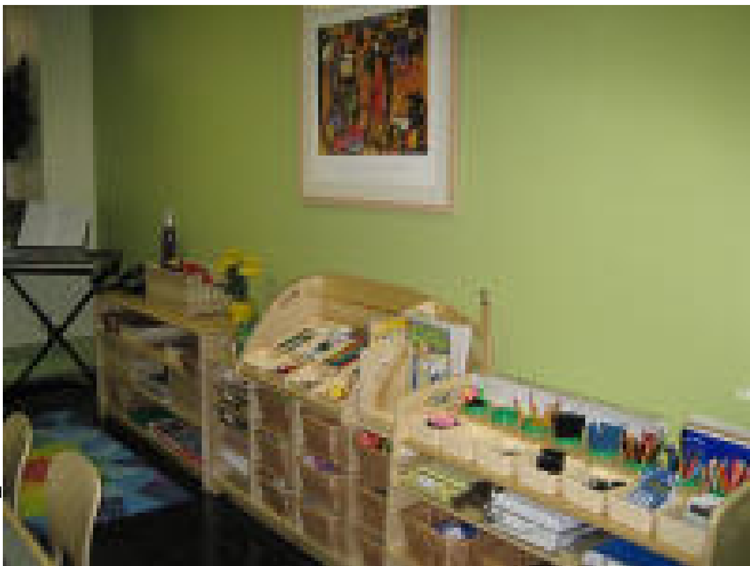
Craft materials, school supplies, and educational games and toys are readily available to spur creativity and learning