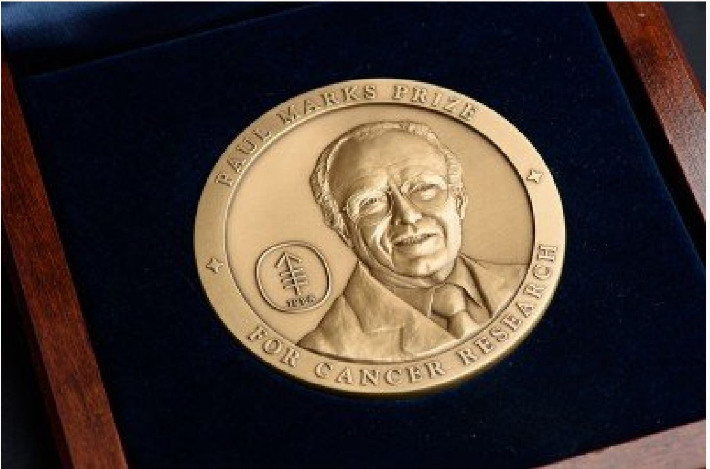
Paul Marks Prize Medal