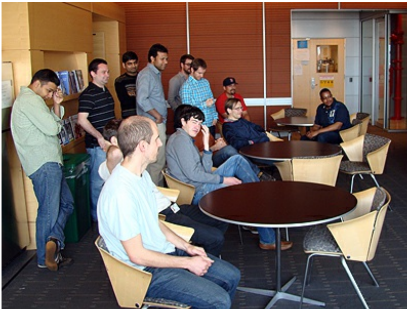
Members of the Tan and Gin Groups are ready to celebrate!