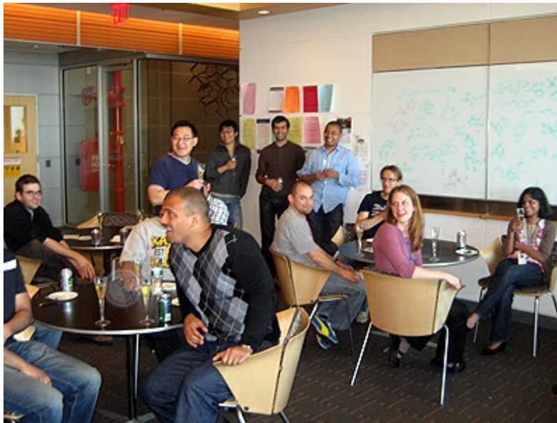
The Tan and Gin groups enjoy the celebration!