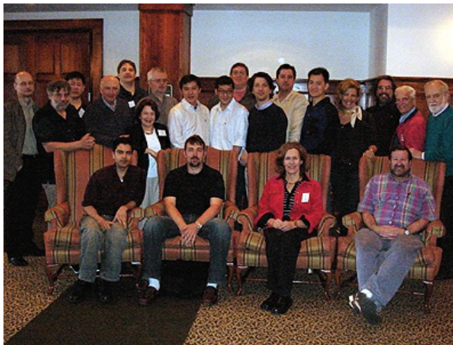
The Pharmacology Faculty always enjoy this annual event!