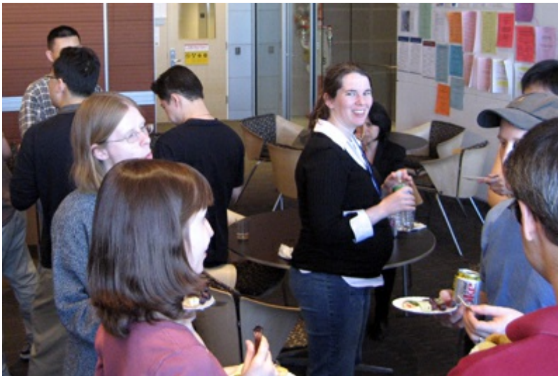
The group enjoys the party.