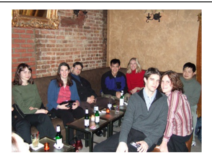
The group hangs out at the Buddha Lounge in the East Village