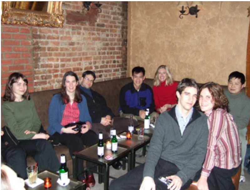
The group hangs out at the Buddha Lounge in the East Village