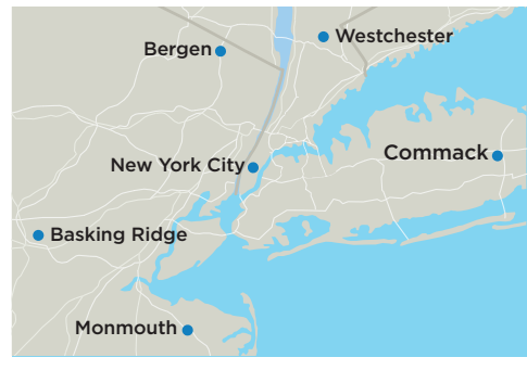
MSK Regional Sites

We offer acupuncture at MSK locations throughout the tri-state area. To make your appointment at MSK Bergen or any of our other locations, or to schedule a free 15-minute phone consultation with one of our acupuncturists, call Integrative Medicine at 646-888-0800.