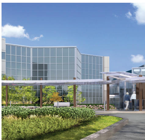
MSK is expanding its presence in New Jersey with the addition of MSK Monmouth (left) in December 2016 and MSK Bergen in 2017.