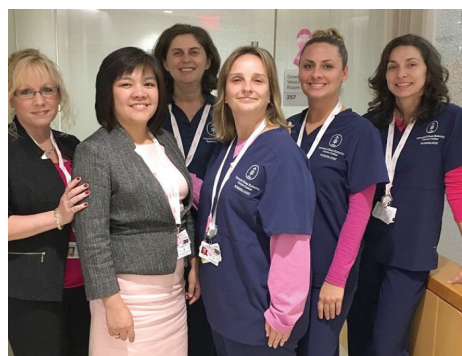
MSK Basking Ridge staff are now seeing patients in a newly renovated, spacious mammography suite, designed to enhance patient comfort and well-being.

At MSK Basking Ridge, patients can get the majority of their cancer care under one roof, close to home. By skipping the lengthy trip into Manhattan, patients save time and travel expenses, and most importantly have peace of mind that they are receiving the latest cancer care.