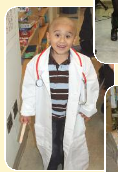
Ready for patients!

boxes. Wishes for ourselves and our families were written down and then stored inside these beautiful boxes. It is such a treat to have our favorite brothers and sisters visit