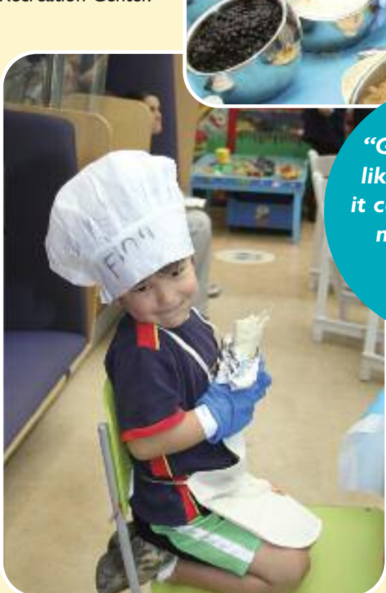
Enjoying a homemade burrito!

The series began with "Flavorful Foods for Finicky Folks," which concentrated on enhancing and adding flavor to foods for kids whose taste buds have changed due to treatment. Some of Chef Peled's ideas included adding lemon salt, vinegar, and soy sauce. She also demonstrated how seasonings and marinades can add a kick to just about any meat or vegetable we cook.