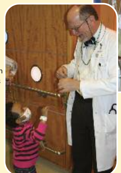
Friends collect beads from the Mardi Gras parade!

Recreation Center first came crown the Mardi Gras king game, followed by pond fishing and chicken races. The party reached its climax during the parade when everyone from doctors to parents and siblings danced, played musical instruments, or handed out beads. When we returned, po' boys and king cake were served for all!