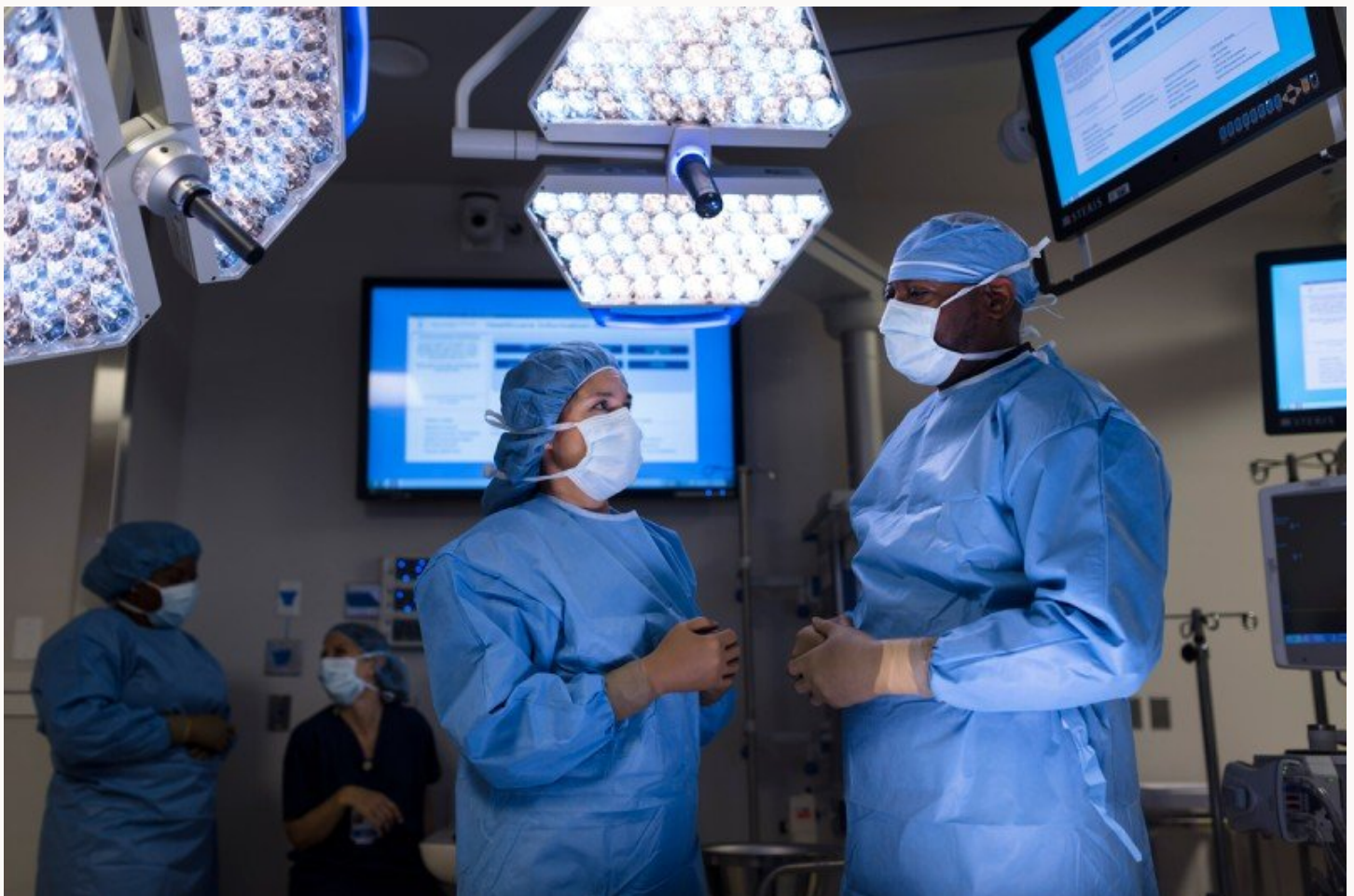
The 12 operating rooms have been specially designed for short-stay procedures.