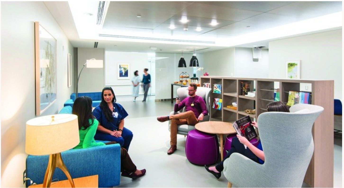
Guests can take a break in our patient lounge.